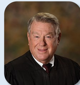
Judge Andrew Logan Trumbull County Court of Common Pleas