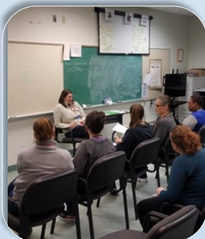
Bri Moon Lake County Re-Entry Coalition

During the cold, snowy winter evenings, male residents often spent leisure time engaging in board games such as Chess, Monopoly, and Scrabble.